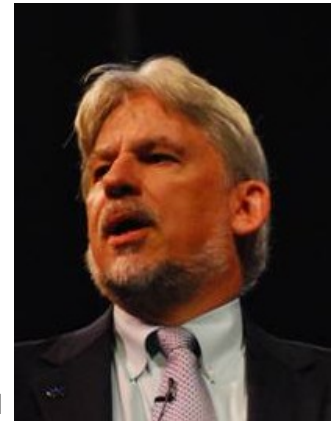
Orientation Fall 2007

You will no doubt notice the changing physical landscape around campus. But I would also like to bring to your attention the changing academic landscape for UB undergraduate students. Students may now elect to enroll in one of our new Undergraduate Academies, which are designed to integrate their studies with life experience. Our new Discovery Seminars offer first- and second-year students the opportunity to interact more intimately with some of our most accomplished faculty.