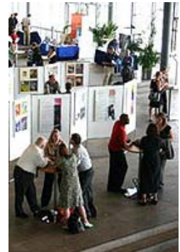
Faculty and students are encouraged to collaborate on research and creative projects