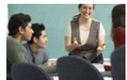
Discovery seminars offer a small class experience.

“Expansion depends greatly on participation by talented UB faculty.”