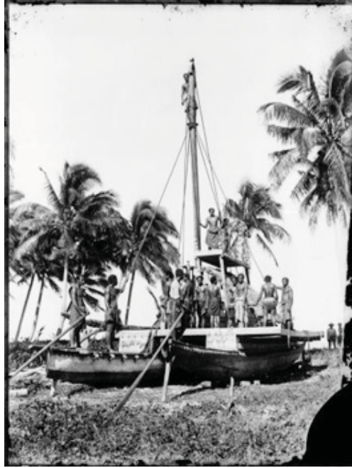
Fig. 1: Double-prowed sailing canoe or ‘alia 1890-1910