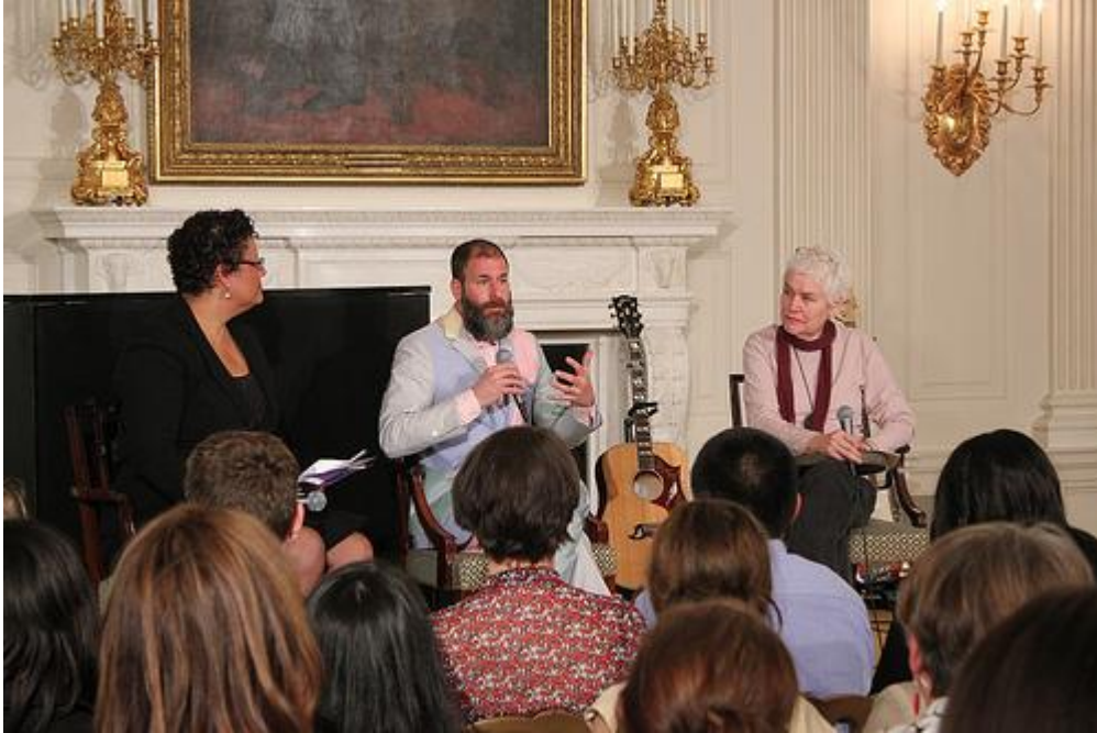
Elizabeth Alexander, Kenneth Goldsmith, and Allison Knowles at the White House in May 2011.

Too many poets act like a middle-aged mother trying to get her kids to eat too much cooked meat, and potatoes with drippings (tears). I don't give a damn whether they eat or not. Forced feeding leads to excessive thinness (effete). Nobody should experience anything they don't need to, if they don't need poetry bully for them. I like the movies too.